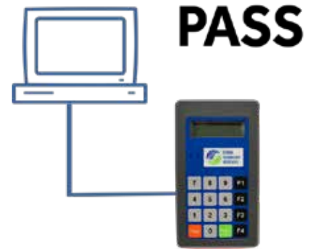
Connected via Computer running Skyward's Educator Access

Setup needs to be done within Skyward before the Positive Attendance screen is ready to use. Once this is done, the screen must be open and active with the keypad/scanner plugged in and the correct room selected. Students can scan or type their ID to be recorded as present in Skyward with the time-stamp. They can also scan out of the room to record an 'out time' time-stamp into Skyward.