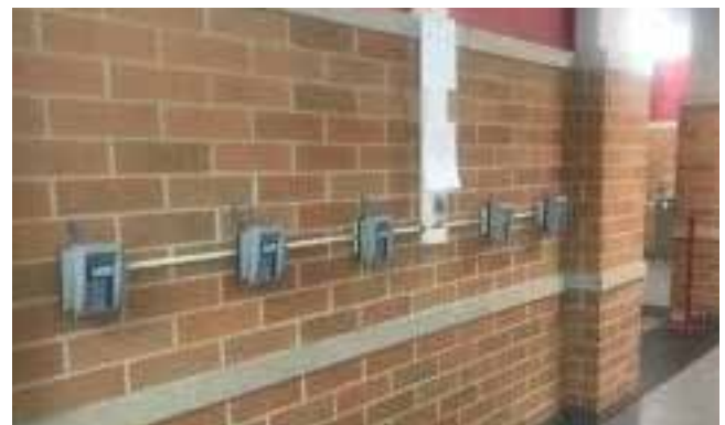
Sheboygan South HS - PASS+ Device Setup in Student Commons Area

Positive Attendance and Nicolet High School