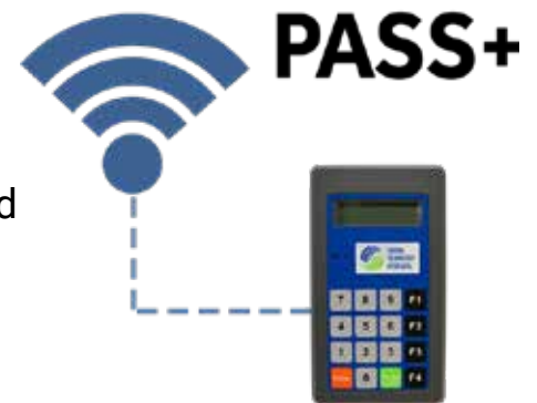
Connected via Network WiFi or Ethernet

These devices do not need to be plugged into a computer. They directly connect to the Skyward network via WiFi, PoE, or Ethernet and are typically hung on the wall in the room where attendance is to be taken. Each device is programmed with the room code associated to its location. Students can scan or type their ID into the device and they are marked present with the time-stamp in Skyward. They can also scan out of the room adding an 'out time' time-stamp into Skyward.