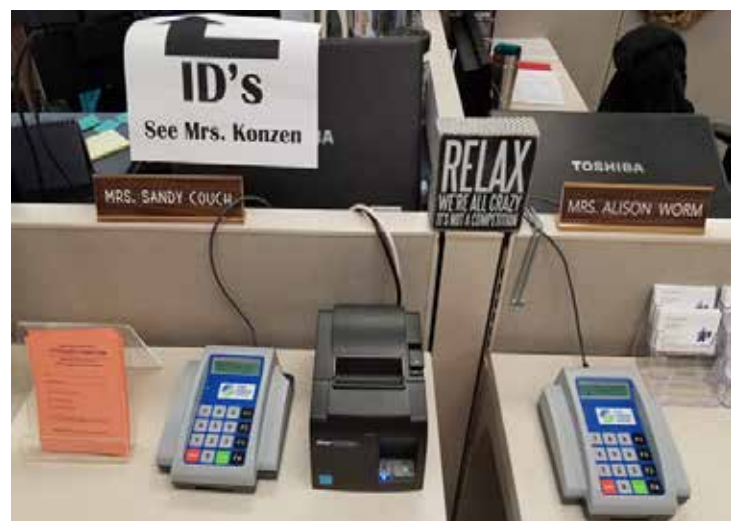
Nicolet High School - Front Office Tardy Kiosk Setup